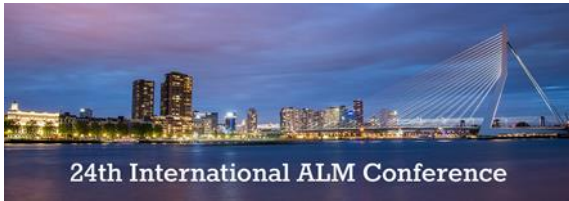
24th International ALM Conference